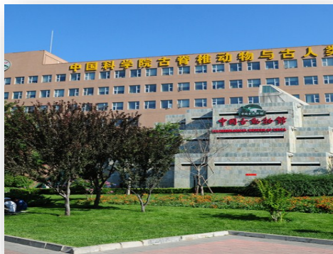
IVPP Main building

Institute of Vertebrate Paleontology and Paleoanthropology (IVPP), Beijing, China